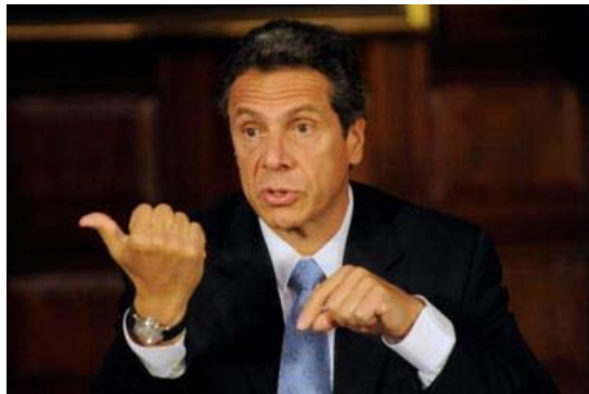
New York Governor Andrew Cuomo (shown here speaking at a cabinet meeting in Albany, New York, earlier this month) says a Medicaid billing error was costing taxpayers $8 million a month.

October 30, 2011